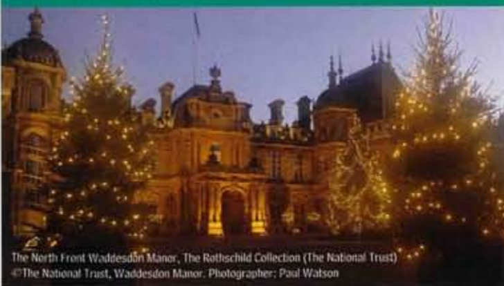
The North Front Waddesdon Manor, The Rothschild Collection (The National Trust)

Why not treat yourself to a Christmas evening out and visit Waddesdon House for one of their Winter Evening events? Take a tour around the house admiring all the festive displays and listening to the beautiful harpist. Finish off by enjoying a glass of Champagne in their award-winning gift shop and then dine on a Rothschild Christmas Dinner in the Manor Restaurant. Tel: 01296 653226 or visit www.waddesdon.org.uk